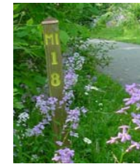
Mile markers are located along the entire Trail!

The Advisory Council's mission is to promote and facilitate the safe public use of the Ozaukee Interurban Trail for transportation, recreation, health, education, economic development, and enjoyment of Ozaukee County's unique cultural, historical and natural resources. The Advisory Council is a diverse representation of all areas of the community in Ozaukee County.