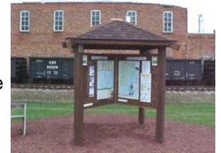
Trail kiosk in Mequon

The Ozaukee Interurban Trail Advisory Council was formed to assist in the planning and implementation of the Trail.