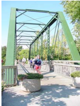
Historic Interurban Bridge in Cedarburg

The route of the Ozaukee Interurban Trail is based on the Interurban Electric Railway that connected Ozaukee County to the Cities of Milwaukee and Sheboygan.