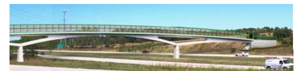
Approximate rendition of Trail Improvement Project. Scheduled to be completed in Summer 2008!

Please visit the Ozaukee Interurban Trail Web Page for additional information and updates.