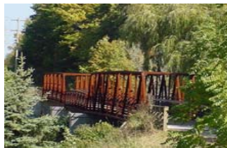
Trail bridge over the Milwaukee River in Grafton

The Trail connects the Ozaukee communities of Mequon, Thiensville, Cedarburg, Grafton, Port Washington and Belgium by using the existing right-of-way owned by We Energies. The Trail can be used as a commuter route for employment, businesses, industry, and commerce.