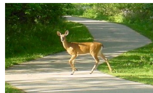
Enjoy wildlife along the Trail!

The Trail route connects historic downtowns with natural landscapes. Views along the Trail include hardwood woodlands, wetlands, farmlands, Cedar Creek, the Milwaukee River, Lake Michigan and it is designated as a "Great Wisconsin Birding & Nature Trail."